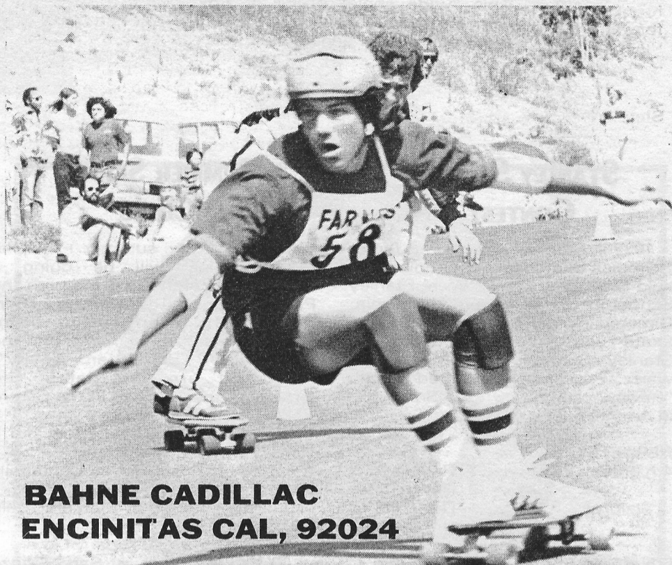
BAHNE CADILLAC ENCINITAS CAL, 92024